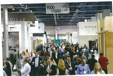
Preparation is under way for Coverings 2015, which is expected to be the largest show since 2009, according to show officials.

ALEXANDRIA, VA.—Orlando Fla., will be home to Coverings 2015, which will be held April 14 to 17 at the Orange County Convention Center.