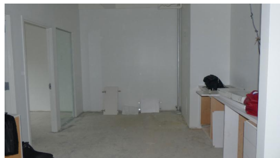
Soon to be Kitchen and Bar