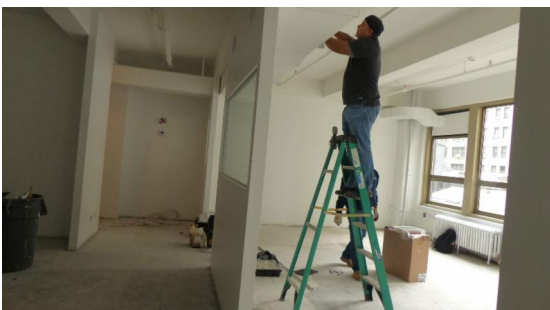
Soon to be Conference Room and Offices