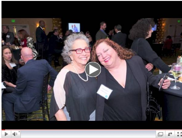
RD Weis Companies 25 Year Anniversary Celebration